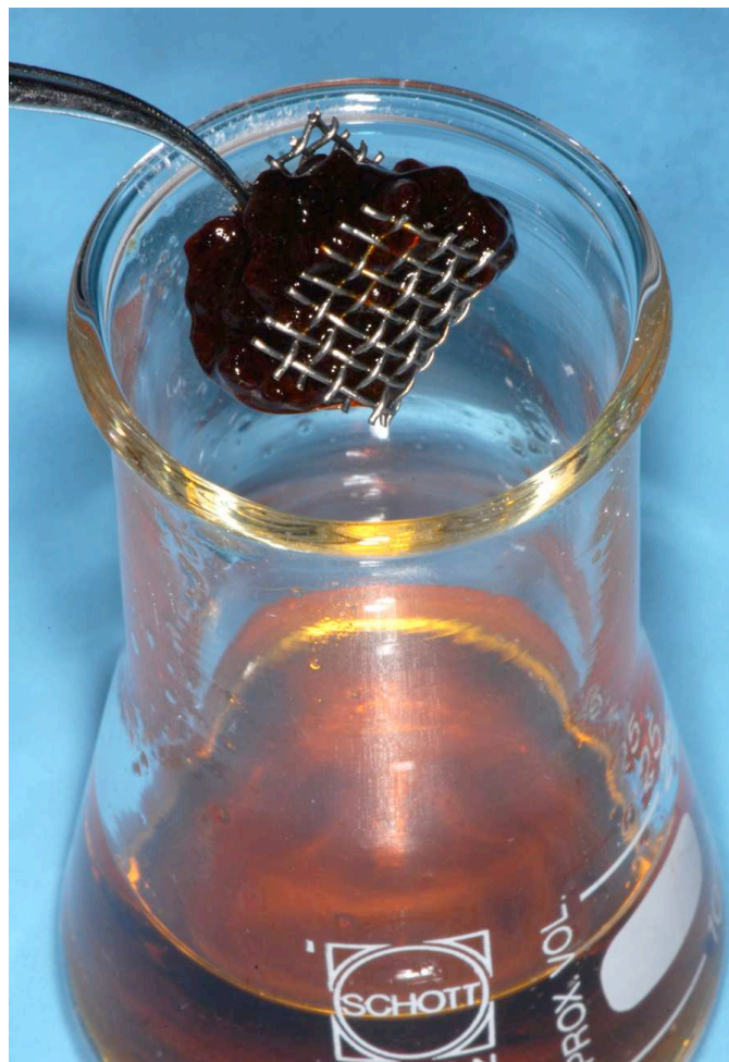
Figure 1: Illustration of the custom-made mesh made of stainless steel, which served for material transfer and stable immersion.

The compounds were weighed on a high precision scale and thoroughly mixed on a sterile glass plate subsequently. One gram of the resulting product was then taken and transferred to a custom-made mesh made of stainless steel (0.1 mm, inner width 1 mm, Figure 1).