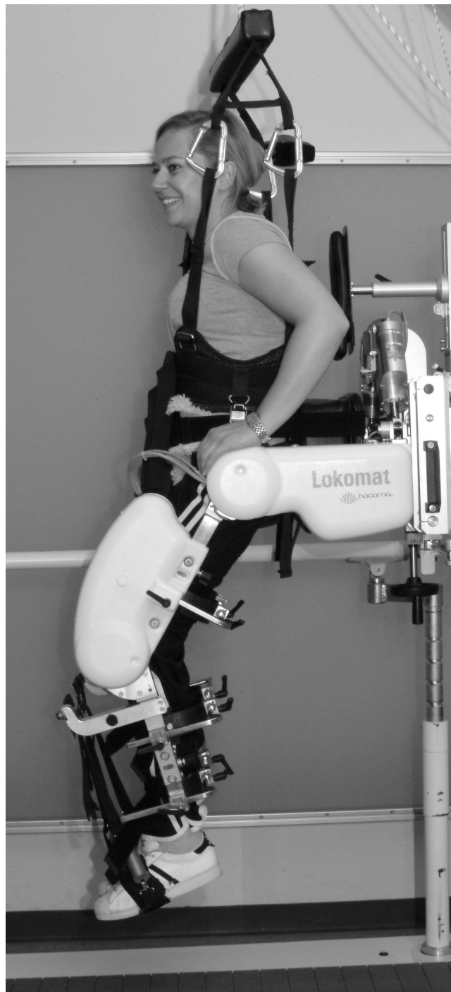
Figure 1 Measuring position of subject in DGO. Subject in the position used for the force measurement in the DGO. The device is set to position control mode with preset fixed joint angles (hip 30° flexion, knee 45° flexion).

The DGO Lokomat is used in combination with a treadmill and a dynamic body weight support system. The DGO controls the patient's leg trajectories in the sagittal plane during walking [14,15]. The hip and knee joints of the DGO are actuated by linear back-drivable actuators integrated into an exoskeleton structure. In every actuator, a force transducer measures the linear forces, whereas potentiometers measure the actual joint angles. The torques acting on each joint are calculated online from these position and linear force values based on the known geometry. For the isometric force assessment, subjects wear a harness and are fixed to the DGO by straps around the trunk and the pelvis. The legs of the device are attached to the subject's legs with cuffs around the thighs and calves. Proximal and distal leg structures of the DGO are adjusted to align hip and knee joints of the subjects with the joint axes of the DGO. Subjects are lifted above the treadmill (unloading from 100% body weight) and the software sets the device to position control mode with preset fixed joint angles (hip 30° flexion, knee 45° flexion; see Figure 1). In this position subjects are asked to perform either a flexion or extension movement in hip or knee joint in left or right leg and push against the orthosis legs according to a defined sequence of tests. The system