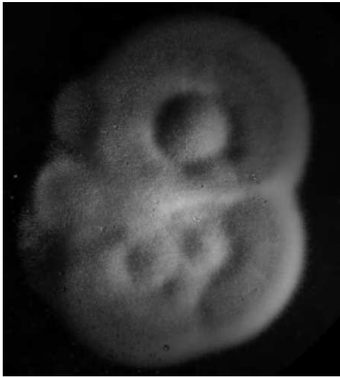
Figure 3. White to buff-brown mould form of H. capsulatum grown at 25°C on Sabouraud's dextrose agar. Large numbers of infectious conidia may be released by the mere lifting of the culture plate lid.

the host, and can range anywhere from mild pulmonary affection to severe disseminated disease. Disseminated disease mostly occurs in patients with impaired cell-mediated immunity [5]. In this context, it is remarkable that invasive fungal infections are not consistently recognized in patients treated with immunosuppressants like corticosteroids and tumor necrosis factor- \alpha blockers [6, 7].