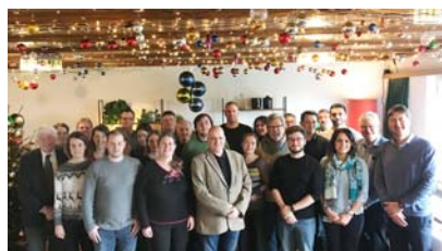
Group Picture (December 2017)